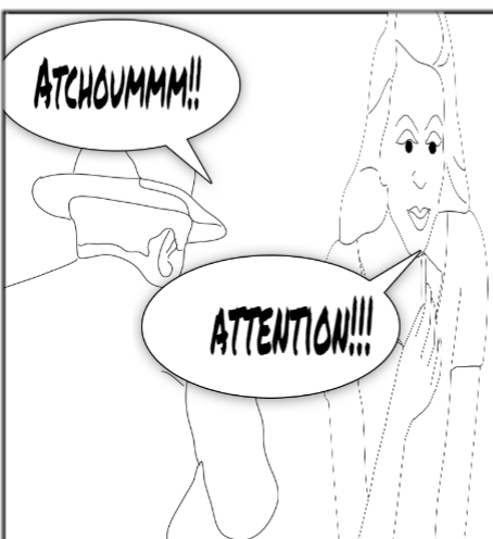
PROTECTIONS INADAPTÉES : CONTAGION