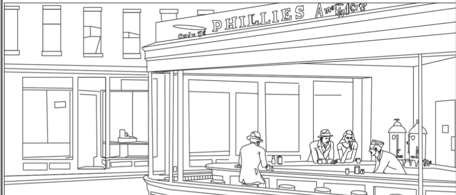
LIEU PUBLIC : TRANSMISSION DU